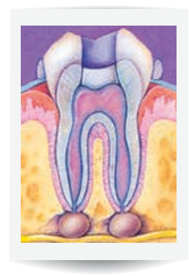
AN OPENING IS MADE THROUGH THE CROWN INTO THE PULP CHAMBER

An opening is made through the crown into the pulp. (Your tooth may be numbed prior to this procedure) The diseased pulp is then carefully removed.