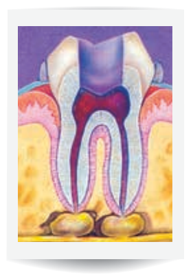
THE PULP IS REMOVED AND ROOT CANALS ARE CLEANED, ENLARGED AND SHAPED

The root canal area inside your tooth in cleaned, enlarged and shaped. depending on your individual case, the root canal(s) and pulp chamber may be permanently filled and sealed. In some cases, a temporary medication is placed in the tooth to control bacterial growth and reduce infection. Most often, a provisional filling is placed in the opening of the tooth until the next visit. In some cases, the tooth may be left open. This allows the infection to drain.