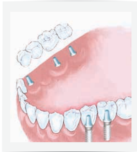
IMPLANT SUPPORTED BRIDGE

It's absolutely amazing the increase in the quality of life that I am living. - plus I have my old smile back. People really notice!