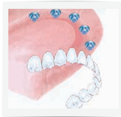
IMPLANT SUPPORTED BRIDGE